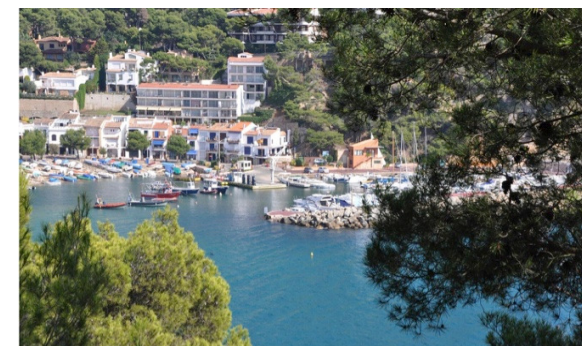
Llafranc, Costa Brava / Spain