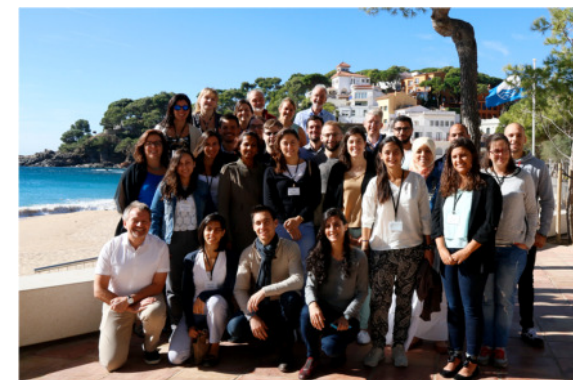
Drug Development Course 2018 3 rd edition