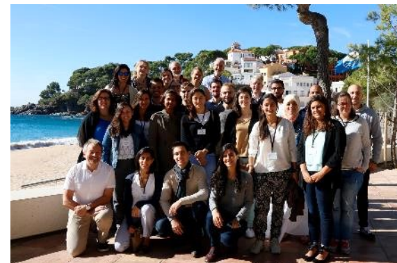
Llafranc, Costa Brava / Spain